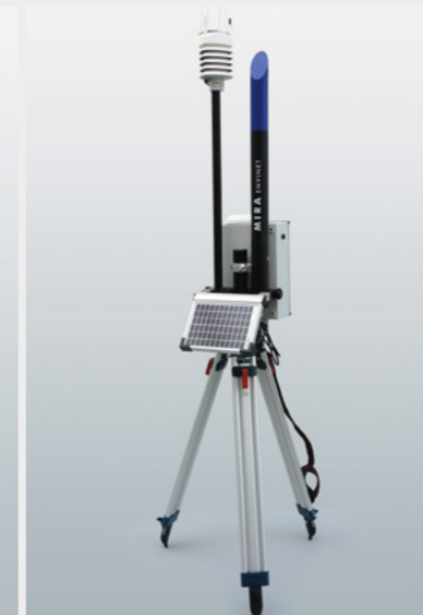
Gamma & Weather Monitoring Station