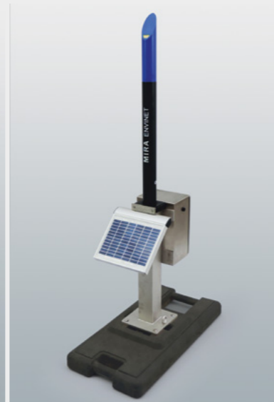
Gamma Monitoring Station