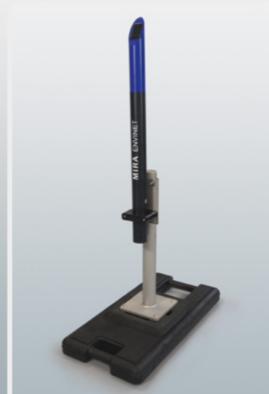
Autonomous Monitoring Station