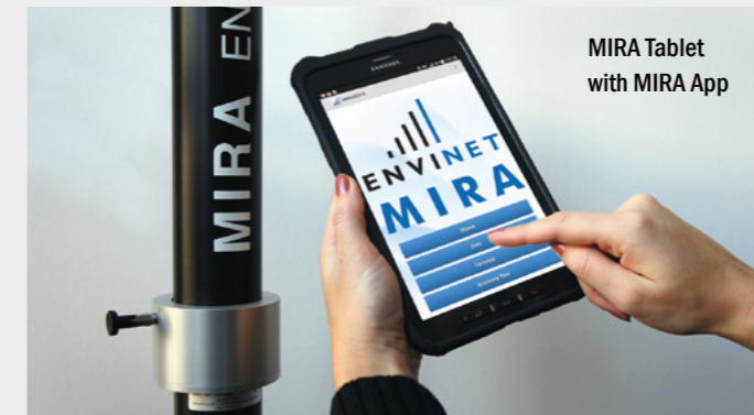
MIRA Tablet with MIRA App