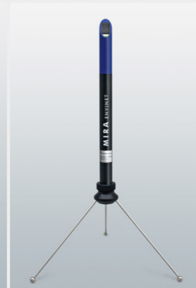
Autonomous Mobile Monitoring Station