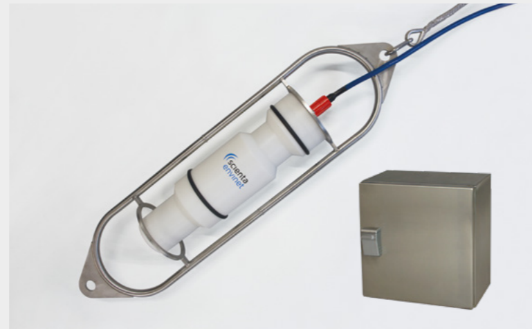
Spectroscopic Gamma Detector TUNA with base station