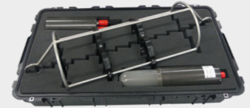
Accessories: Mobile base station, transporting solutions for standard- and deep-sea detectors, test- and verification equipment