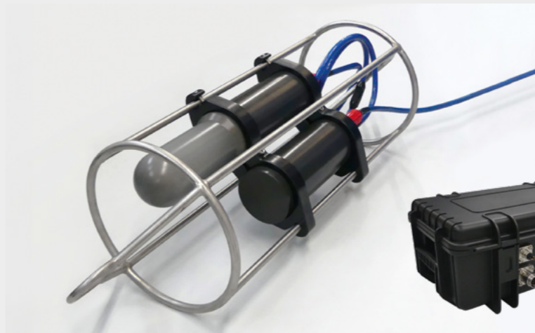
Spectroscopic Deep Sea Gamma Detector TUNA with mobile base station