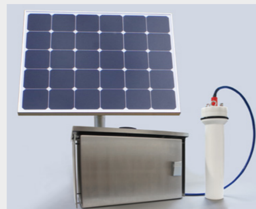
TUNA fixed base station for fully autonomous operation using solar, battery and LTE.